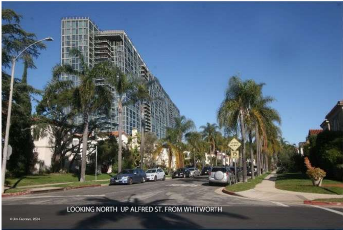
LOOKING NORTH UP ALFRED ST. FROM WHITWORTH